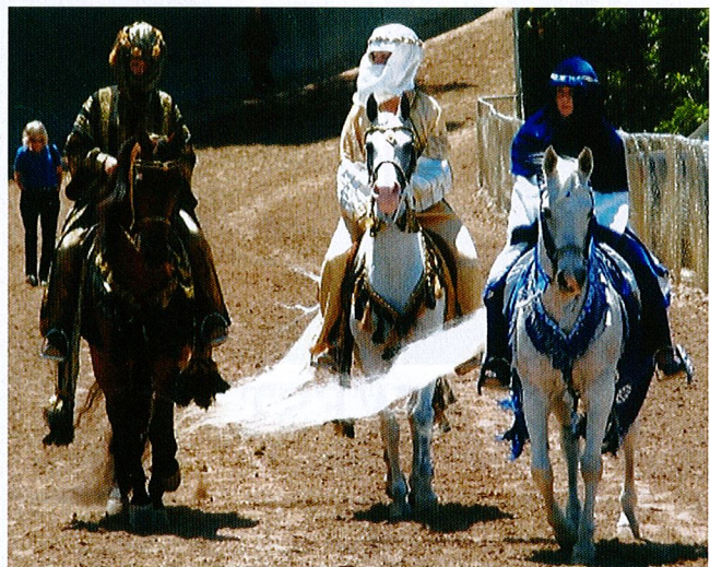
ABOVE & RIGHT: During the Sheikh Zayed Bin Sultan Al Nahyan Global Flat Racing Festival Series in California, members of the DAHA donned native costumes and raced in front of the crowd.

For an unprecedented third year in a row, Diablo Arabian Horse Association (DAHA) was honored as the Club of the Year. They also won the award for Breed Promotion/Community Involvement for their considerable outreach activities promoting Arabian horses to both horse people outside of the Arabian community and the general public. In addition to the two highly popular Class A Arabian horse shows the club holds each year, members participate in parades, the Horse Faire at Heather Farms and Day of the Horse. At DAHA Day at Golden Gate Fields during horse races, they ran a concession stand and talked to racing fans about Arabian horses,