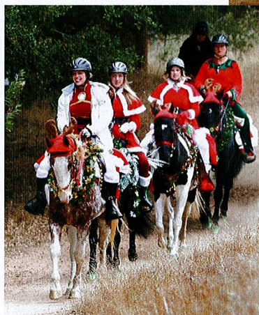
LEFT: DAHA members are decked out for Christmas during their December trail ride.