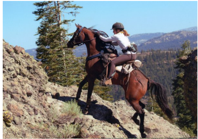
"Cougar Rock on Tosca" shows me going over Cougar Rock (surprisingly :) on Tosca BL in 2004. We finished 36th, it was her first Tevis and she was my project horse at the time.

Lower Right Photo: "Shadow Climbing Squaw" shows me and Bey Shadow BL coming up to Squaw Valley's High Camp in 2003. We finished 8th.