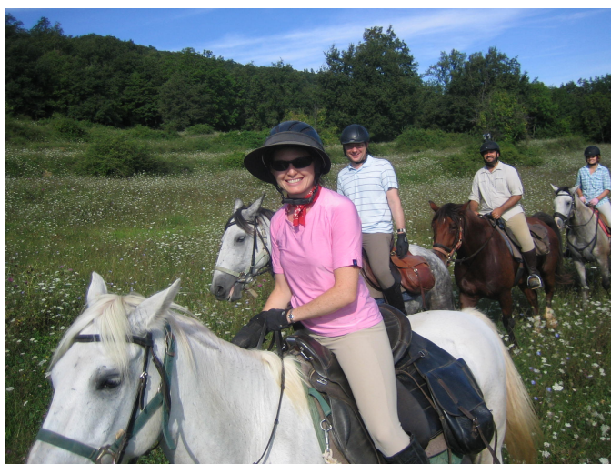
Me and my noble steed Fosco and my fellow ride mates riding through a meadow in Northern Spain

Author Note: Interested in an Equestrian Vacation? Check out www.hiddentrails.com and www.equitours.com