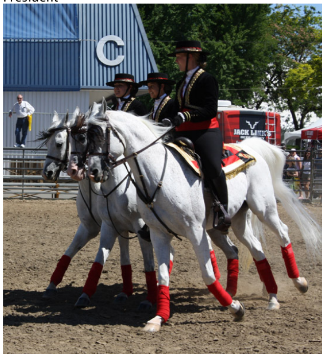
Amigos De Anza Equestrian Drill Team at Cal Horse Expo, see article on page 3