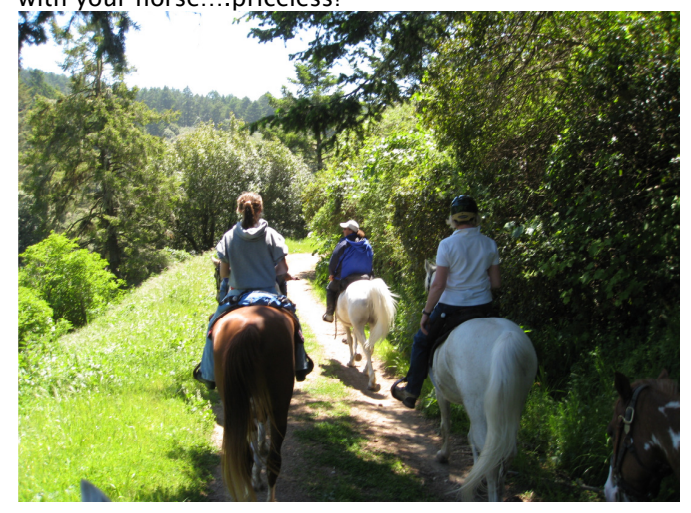
Point Reyes, CA has some wonderful horse camp sites and trails

Now that it is summer, many equestrians think about horse camping. We are lucky to be here on the west coast and have many fantastic horse camping sites. If you are interested in horse camping, check out this website: <a href="www.marintrailguide.com">www.marintrailguide.com</a> to see all of the horse camp sites between San Luis Obispo to the south, Oregon border on the north and over to Reno – Washoe Valley Area to the east. All you need to do is download the FREE PDF. It also includes locations, contact names, addresses, phone numbers, websites, links etc. Vacation with your horse....priceless!