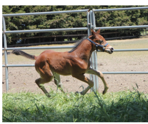
A future winner? Ofrank's first son

Fairplex Park (Pomona) 9/8 - 9/26/11 Fresno (Fresno Co.) 10/5 - 10/16/11