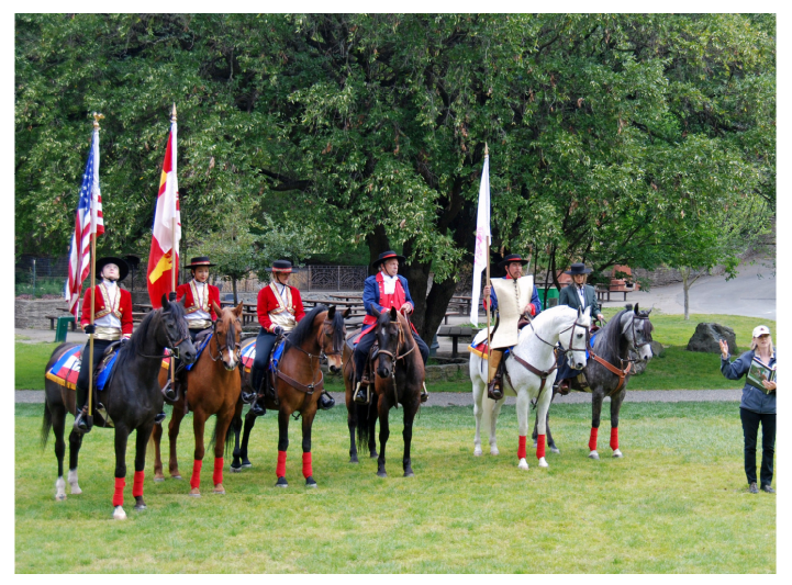
Amigos de Anza at the CA Trails & Greenways Convention, see page 4 for article.