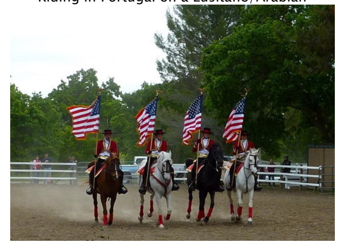
Riding in Portugal on a Lusitano/Arabian

Have you ever considered horse riding on your next vacation? What better way to see the world than from the back of a horse. I just booked my equestrian vacation to Barcelona in September to ride Andalusians through Medieval villages and see castles and I can't wait! I have also been able to ride Irish Hunters in Sligo, Ireland, Lusitanos in Milfontes, Portugal and Selle Français / Arab crosses for a week in Bordeaux, France on riding vacations. It's a wonderful way to enjoy parts of the world that are not easily accessible to most tourists and it's a great way to enjoy the local culture, food, people and horses with fellow equestrians from around the world. These vacations are also all inclusive except for the air flight so they are usually great deals. Just about any place in the world that you have ever wanted to visit is available for horse riding. Check out Equitours at www.equitours.com and Hidden Trails at www.hiddentrails.com for your next riding vacation! I can't wait for my next vacation on horseback, seeing the world between the ears of a horse.