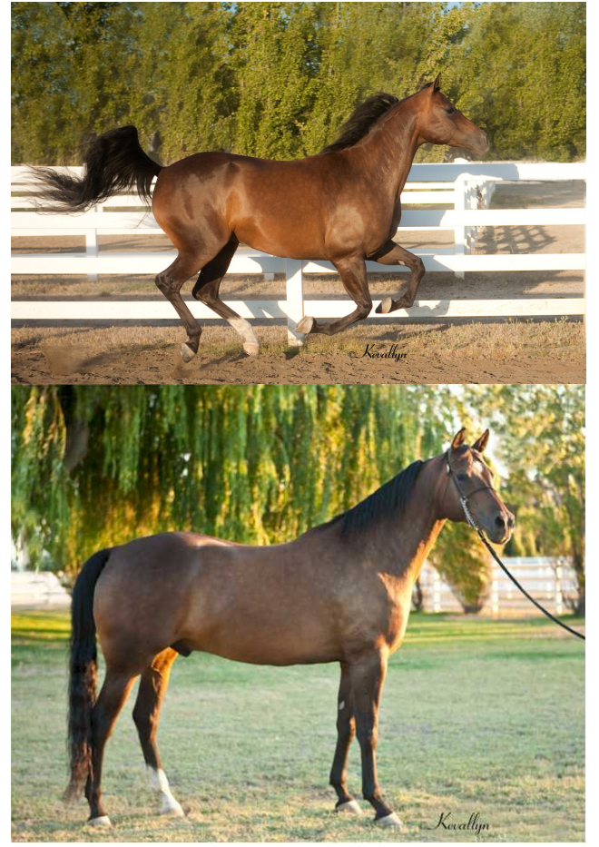
"Beau"