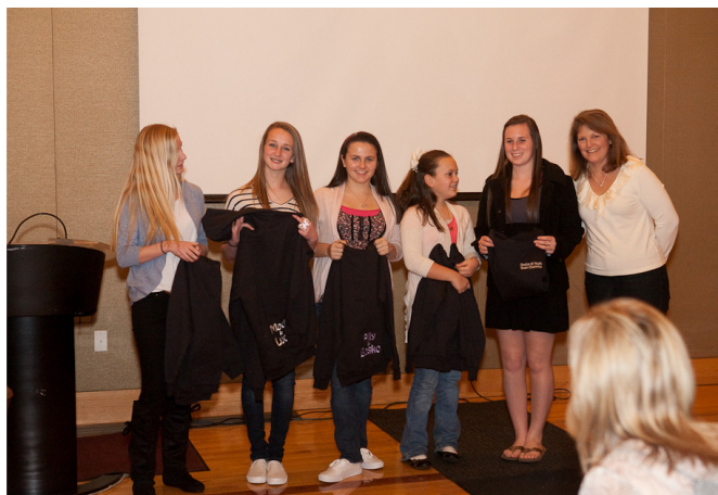
AHA Nationals Youth Competition Award Winners' Mitchell's Mauraders.