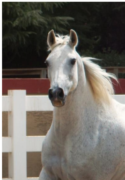
Family Arabian Tazmoonian Devil

DAHA has 32 youth members and they now have a webpage dedicated to them! The website contains youth news and events, a photo album, blog; AHA and Region III Scholarship information, youth horse camps listings, youth equestrian activities, Youth Coordinator and Directors contact information as well as fun Arabian facts and information. This webpage can be found at www.diabloaha.org !