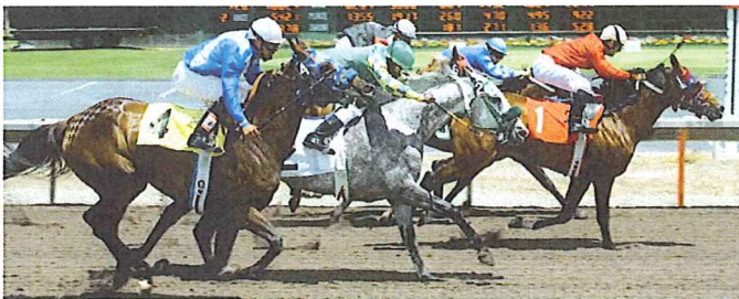
Ofrank winning his race!